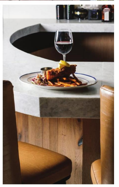
Loews Hotel 1000 recently revamped its look and includes the Greenhouse meeting space (top) and the new All Water Seafood and Oyster Bar restaurant (below).

square feet of meeting space. The new All Water Seafood and Oyster Bar restaurant is a beautiful addition to the venue, as is the hotel's unique golf simulation room, which provides a fun option for team-building. Lindsey Burns, regional director of marketing, says, "Guests can enjoy a flight of seasonal craft beer as they tee off at one of 50 of the world's best golf courses with our two virtual golf stations." loewshotels.com