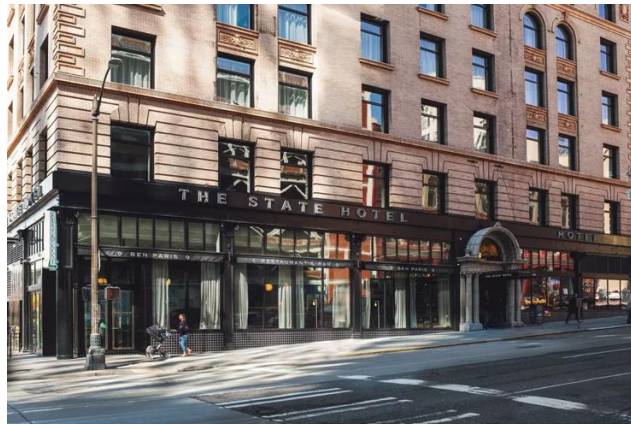
The State Hotel's entrance, with the original archway and a new steel canopy.

The opening follows a dramatic restoration