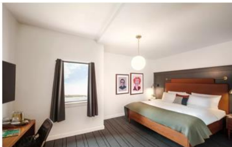
A room with a king bed and a water view.