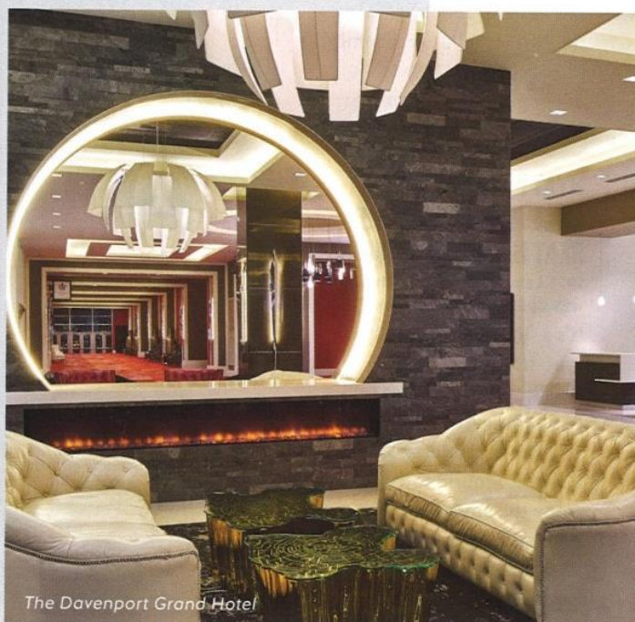
The Davenport Grand Hotel